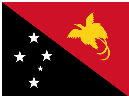
The flag of Papua New Guinea made up of a Raggiana bird-of-paradise (PNG's national bird) and the southern cross all in traditional colours.

As these magazines are distributed, let the words of our Lord, that His Word will never come back empty, be an encouragement to us.