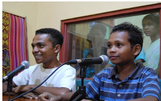
Some children in Indonesia attending an announcer's workshop.