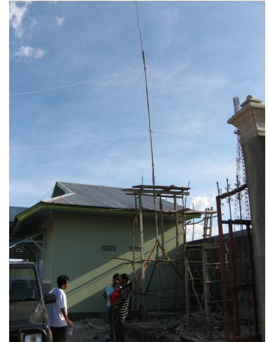
A partner FM radio station in Soe, Timor, Indonesia.